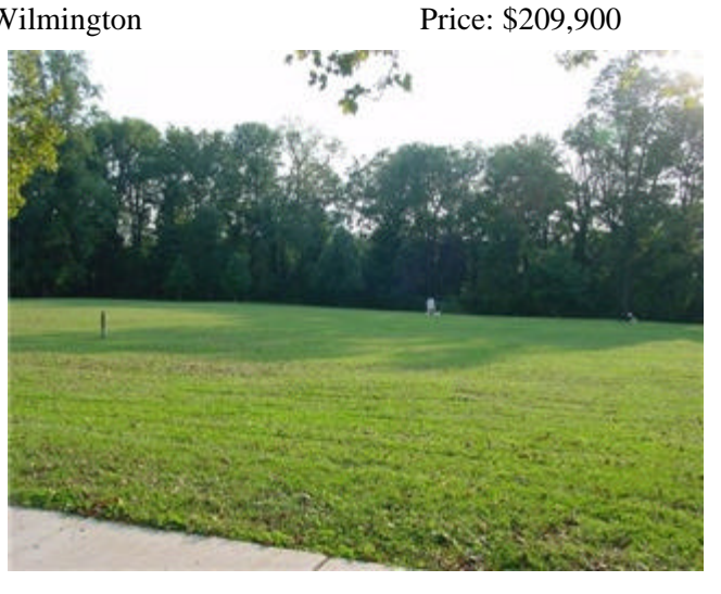
Brandywine Park - Across the Street