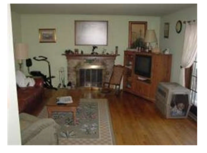
Family Room W/Stone Fireplace