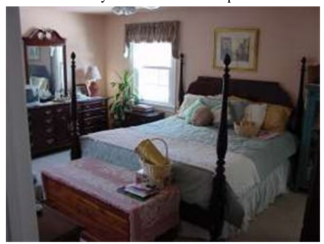
Large Master Bedroom