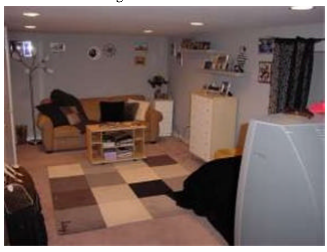
Finished Basement / 4th Bedroom