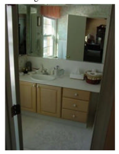
Updated Master Bathroom