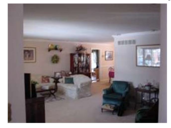
View of Living Room from Foyer