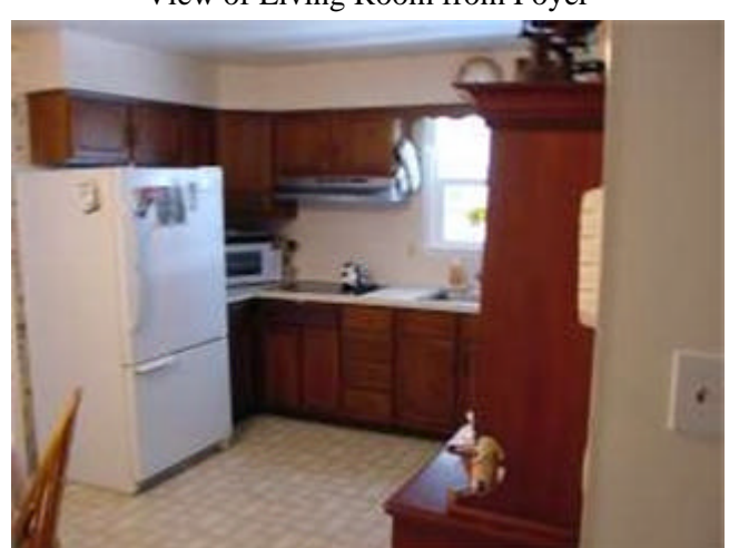
Large Eat-In Kitchen