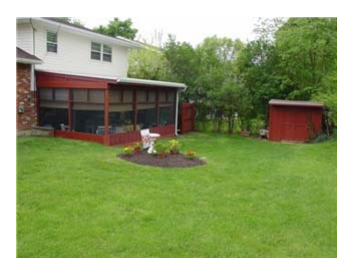
Screened In Rear Porch