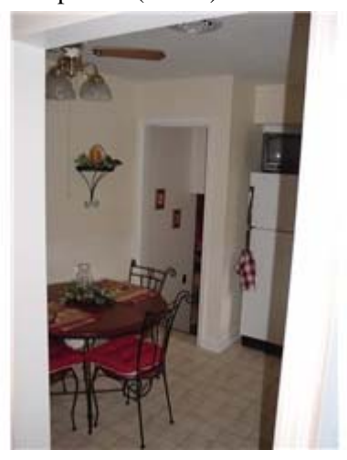
Updated (Eat-In) Kitchen