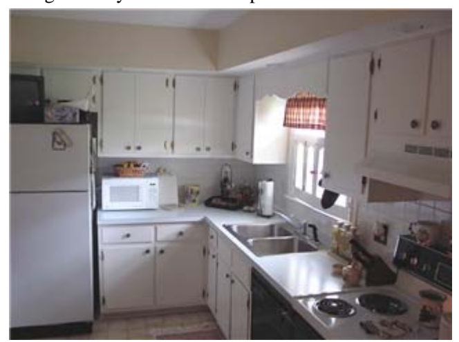
Updated (Eat-in) Kitchen