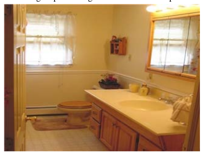
Updated 2nd Floor Bathroom