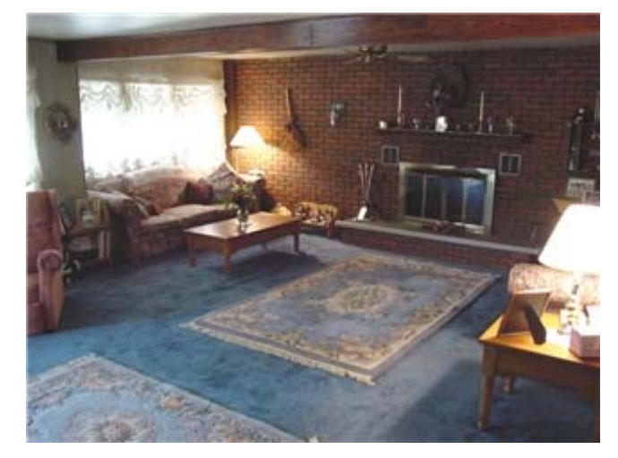
Huge Family Room with Exposed Brick Wall & FP