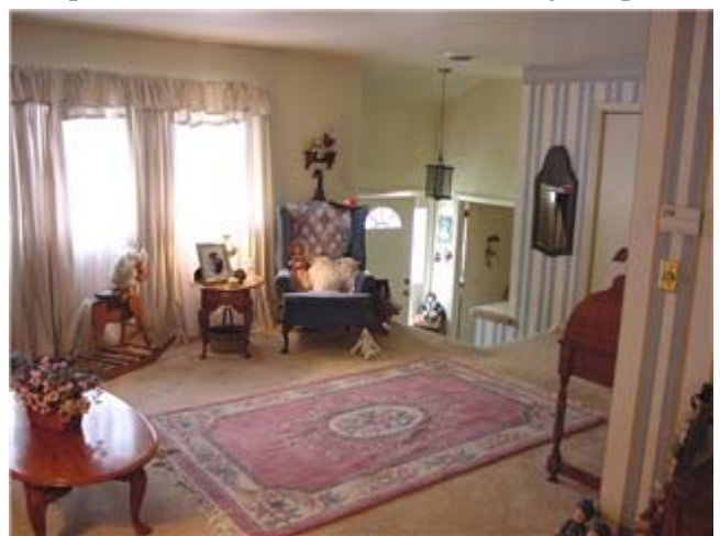
Large Open Living Room with New Carpet