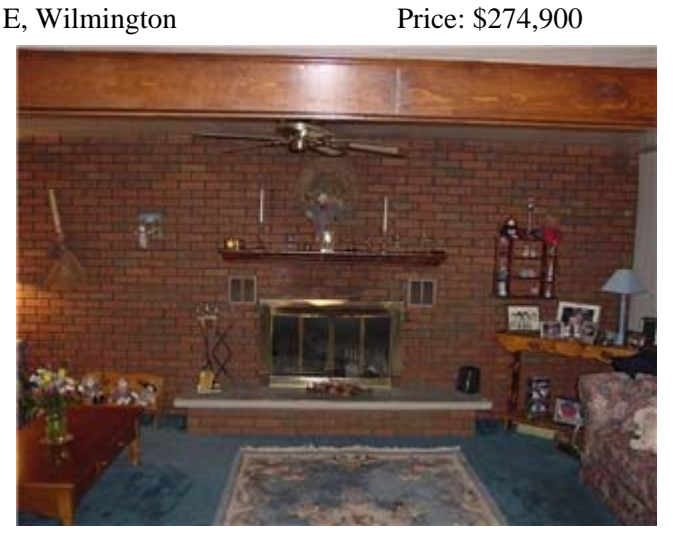
Exposed Brick Wall with Wood Burning Fireplace