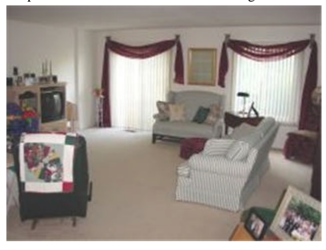
Large Open Living Room with Slider to the Deck