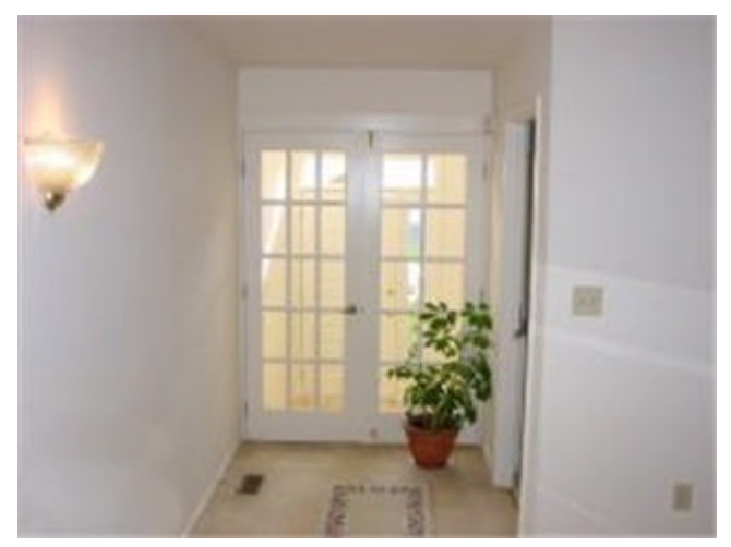
Beautiful Foyer w/ Upgraded French Doors

34 Cardenti Ct, Newark Price: $189,900 ML#: 4405383