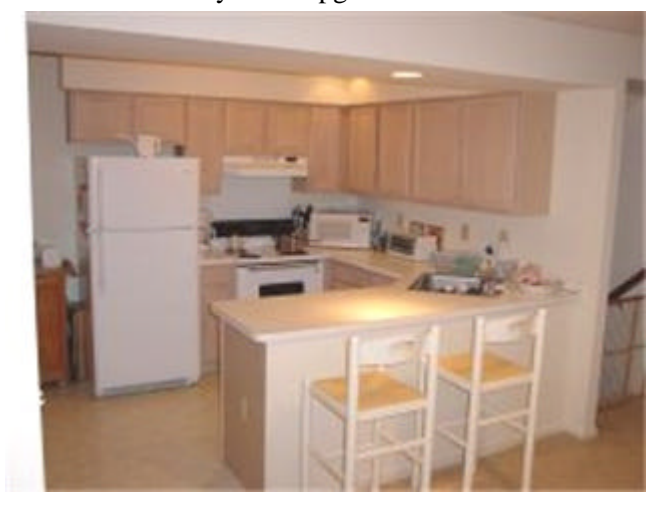
Spacoius Kitchen - New Refrigerator & Dishwasher