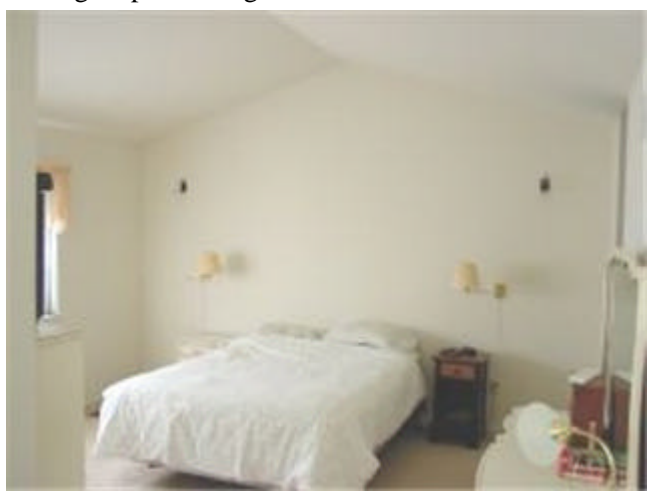
Master Bedroom w/ Vaulted Ceiling & Sitting Room