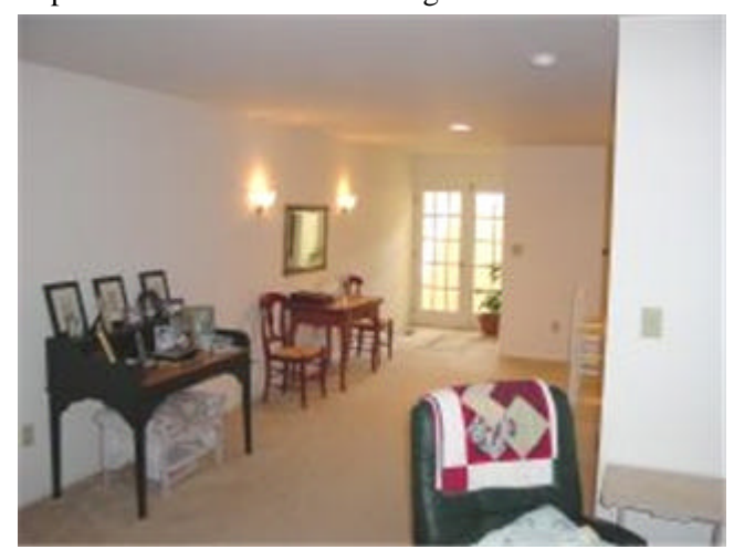
Foyer Area Leading into the Dining Area