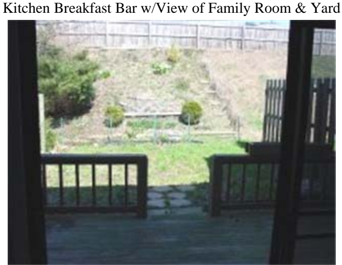
Deck & Backyard