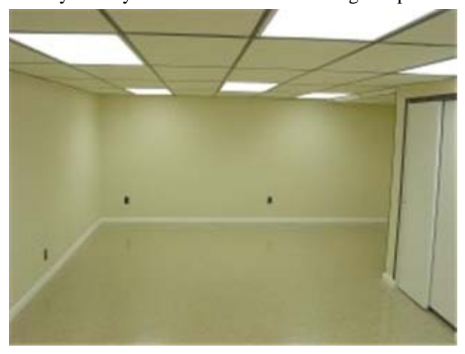
Large (23 X 17) Pro Finished & Water-Proofed BSMT

For More Information Contact: Vince Grillo