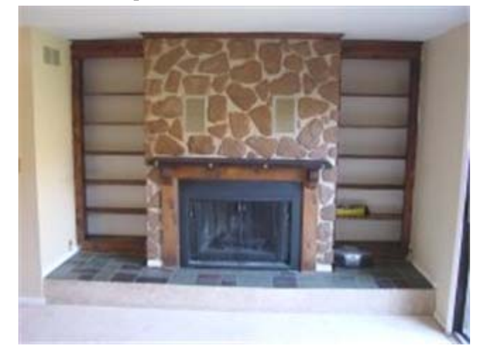
Cozy Family Room with Wood-Burning Fireplace