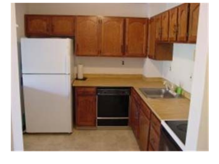
Open Kitchen with New Floor