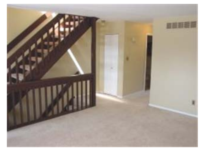
Inviting Living Room with Open Stairs to 2nd Floor