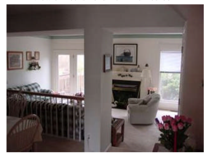
Dining Room & Sunken Living Room w/ Gas Fireplace