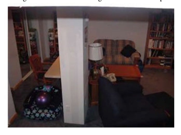
Finished Basement - Family Room or Office??