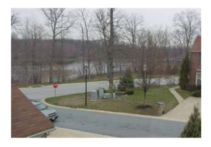
View of Becks Pond from 2nd Bedroom