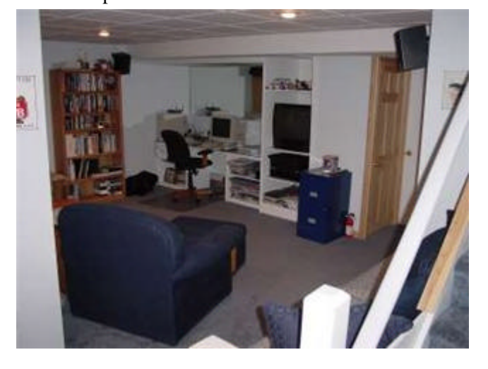
Finished Basement with Loads of Extra Storage