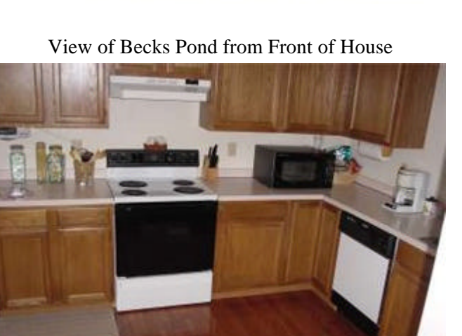
Open Kitchen with Hardwood Floors