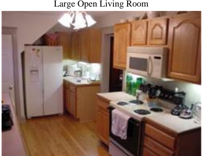
New Eat-In Oak Kitchen