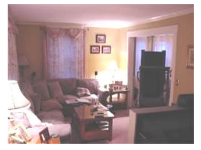
Large Open Living Room

ML#: 4451485 9 FRANKLIN AVE, Claymont Price: $172,900