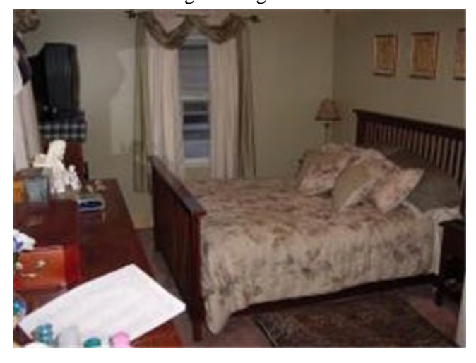
New Master Bedroom - 2 Closets & Walk-Up Attic