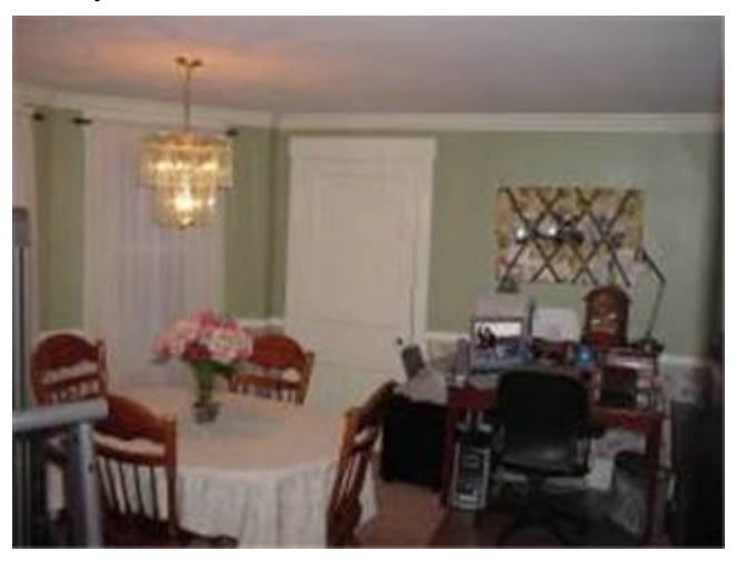
Large Dining Room